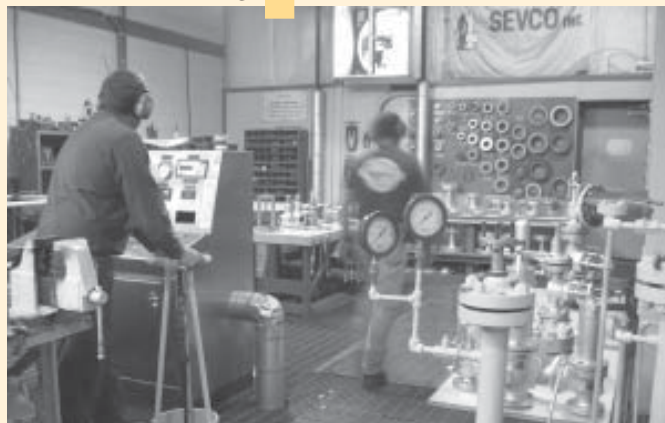
Flanged valve inventory up to 8" inlet in both carbon steel and cast iron.

SEVCO is a factory authorized assembler for Conbraco and Crosby safety relief valves. Steam, air and liquid stands can cover valve sizes from 1/2" – 20" and pressures up to 5000 psig.