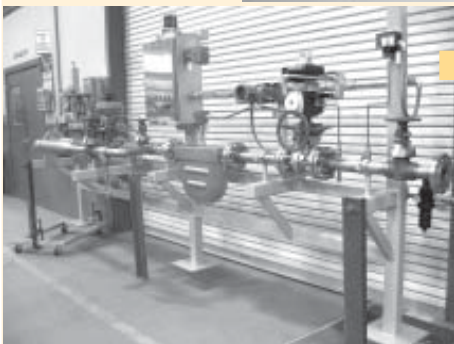
Finished skid system for ammonia metering and distribution to SCR Systems.